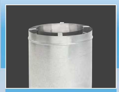
ONE PIECE FLUE AND CASING DESIGN INCREASES PRODUCTIVITY AND REDUCES COST, WITH NO ASSEMBLY REQUIRED.