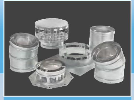
A COMPLETE PRODUCT LINE OF COMPONENTS AND ACCESSORIES TO SERVE YOUR NEEDS.